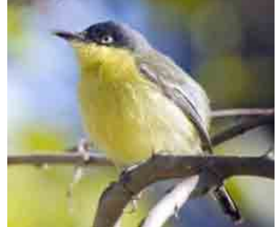
— what is this bird?