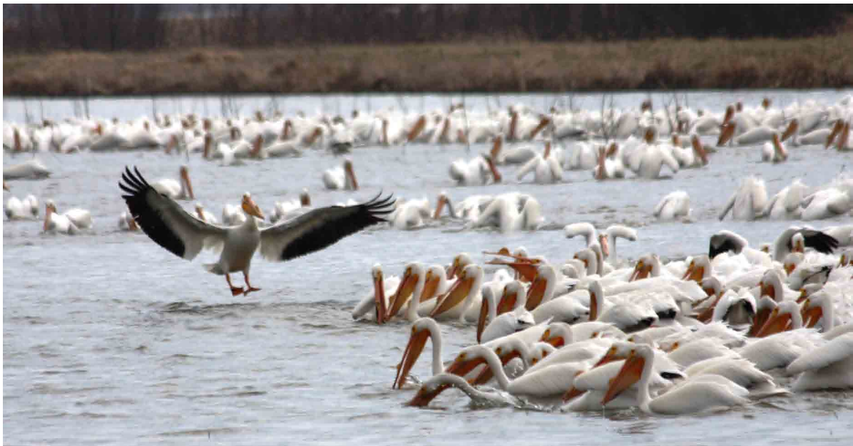
Hahus Photos— white Pelican and some Woodcock nest pics-- Goose Pond and Ben Hawes Rudy Mines