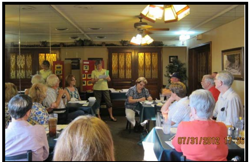
Ideas meeting at Moonlite Barbeque.