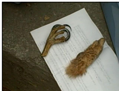
The difference between the foot of a red-tailed hawk, left, and great-horned owl is striking.

"You know those alien movies where they make that really scary scream? He screams like that, and it's really eerie," she said