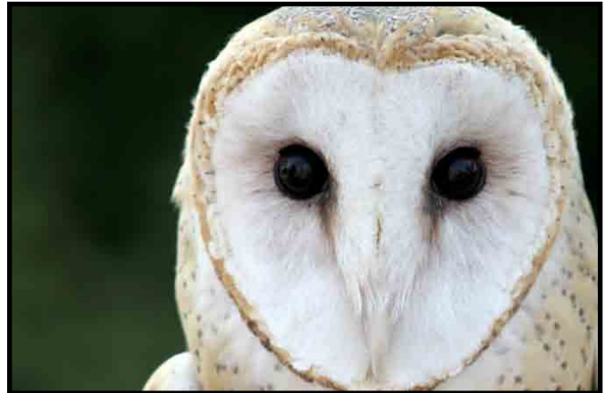
ok, who are you? Have you been to the Cincinnati Zoo.