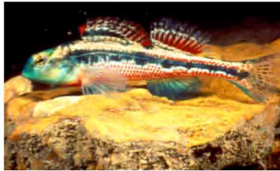
Splendid Darter, endemic, Etheostoma barrense