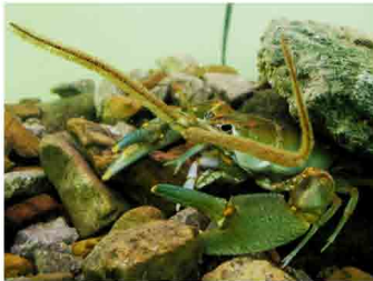
Bottlebrush crayfish, endemic, Barbicambarus carnotus