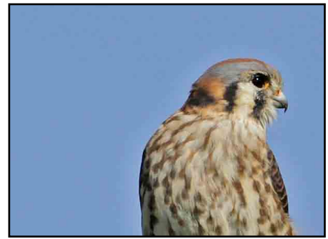
— what is this bird?