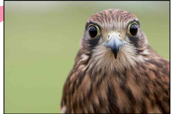
— what is this bird?