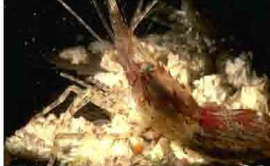
Kentucky Cave Shrimp, endemic, E, Palaemonias ganteri