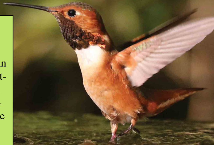
Allen's Hummingbird

DCAS field trip to the wetlands boardwalk of the John James Audubon State Park wetlands: We will meet Feb 18, at 8 a.m., at the backlot of moonlite BBQ, to then carpool to the state park.