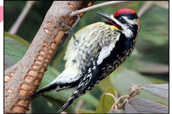
— what is this bird?