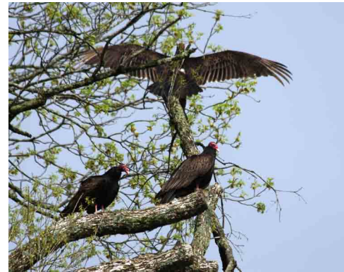
Hahus pic's from Earthday weekend.

* Decomposition depends on weather and site conditions: warm, wet conditions enhance decomposition, as does exposure to sunlight and oxygen. Material sheltered from weather and sunlight requires increased time to decompose.