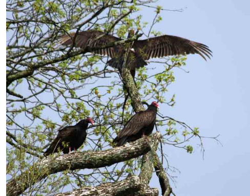
Hahus pic's from Earthday weekend.

* Decomposition depends on weather and site conditions: warm, wet conditions enhance decomposition, as does exposure to sunlight and oxygen. Material sheltered from weather and sunlight requires increased time to decompose.