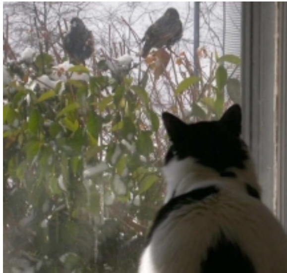
Tyson, Doralee St. Clair's indoor cat, was in Seventh Heaven with the blizzard's birds for hours of entertainment.

The horrors on the television screen showing hundreds of cars and tractor trailers stranded by the snow last week was in diametrical contrast to the scenes that many of us saw outside our windows. THE BIRDS WERE MARVELOUS. Some of us ran out of black oil sunflower seed before we could dig out to restock. More than one of us counted a dozen or more Purple Finches at one feeder. It was a winter wonderland for our pet cats as well as they gazed through the windows for hour after hour almost mesmerized by all the activity around the feeders.